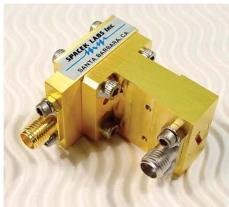
Pictured with waveguide to coaxial transition