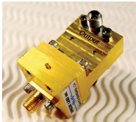
Pictured with waveguide to coaxial transition