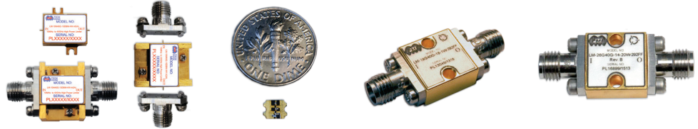
LM-10M35G-15DBM-4W-292FF LM-10M40G-15DBM-4W-AGAL LM-10M50G-18DBM-4W-24FF

2-IN-1 - Dual Use Connectorized or Surface Mount