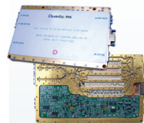
Switched Filter Banks