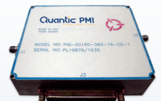
I/Q Vector Modulators