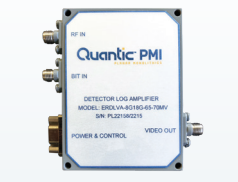
Log Video Amplifiers (DLVA, ERDLVA, SDLVA)