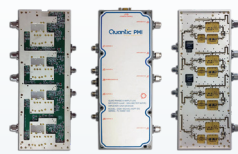
Form, Fit, Functional Products & Services

Quantic PMI designs and manufactures a full range of solutions for your most demanding RF and Microwave challenges.