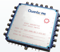
Integrated Switches & Switch Matrices