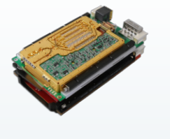
Open VPX Architecture Modules & Assemblies