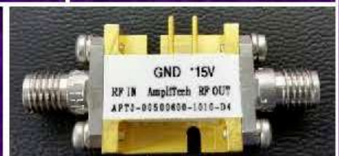
APT3-00500600-1010-D4 Wideband Amplifier (NF<1.0dB) for PCS, GPS, WiFi & 4G/5G