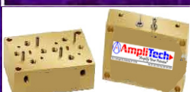
NEW 50-75 GHz 30dB Gain, 5dB NF LNAs!