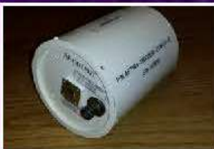
Ruggedized & weatherproofed Ka-Band SATCOM LNA (185K Noise Temp.)

THE BEST AMPLIFIERS IN THE WORLD...AND MORE!