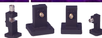
End-launch & angled waveguides for 1.12-60 GHz!