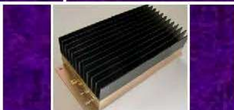
NEW HPA Series 430—530 MHz 22-28W RF Power Amplifier