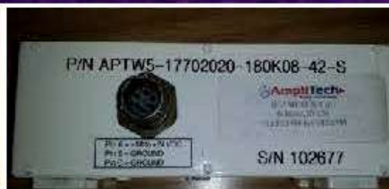
Ka-Band w/custom power connector (140K Noise Temp.)