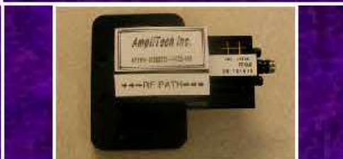
APTW5-07250775-44K20-112 X-Band Waveguide WR-112 SATCOM Low Noise Medium Pwr LNA